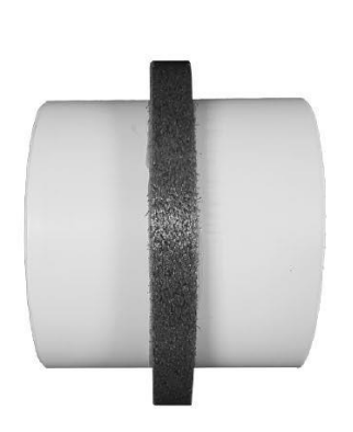
Airbox mod. VMABOX12490